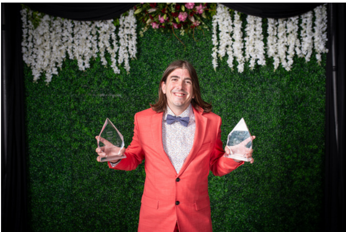
Rave BBQ Rubs Small Business Award Business Marketing Award