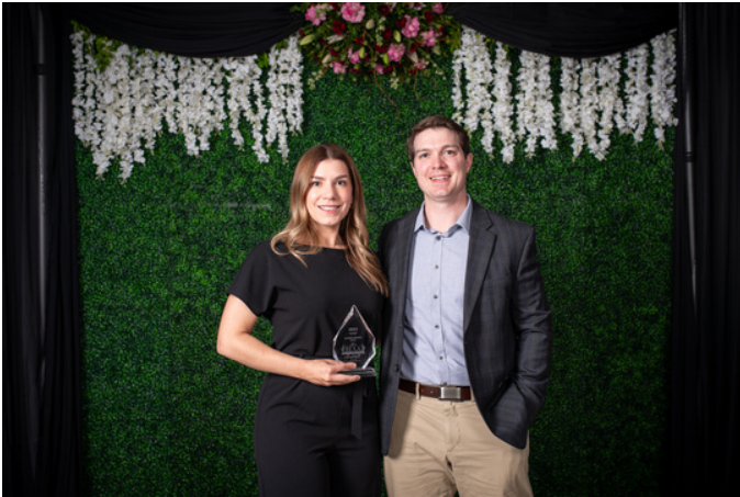
Warman Hearing Clinic New Business Award