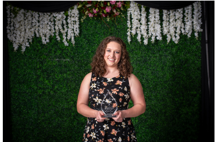
Nova Physiotherapy Customer Service Award