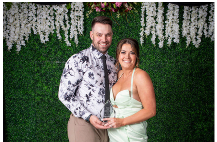
Passions Beauty Studio & The Barber Corner Business of the Year Award