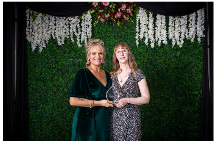
Lakeview Insurance Brokers - Martensville Community Involvement Award