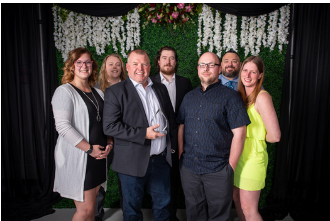
Checked Flag Automotive Employer of the Year Award